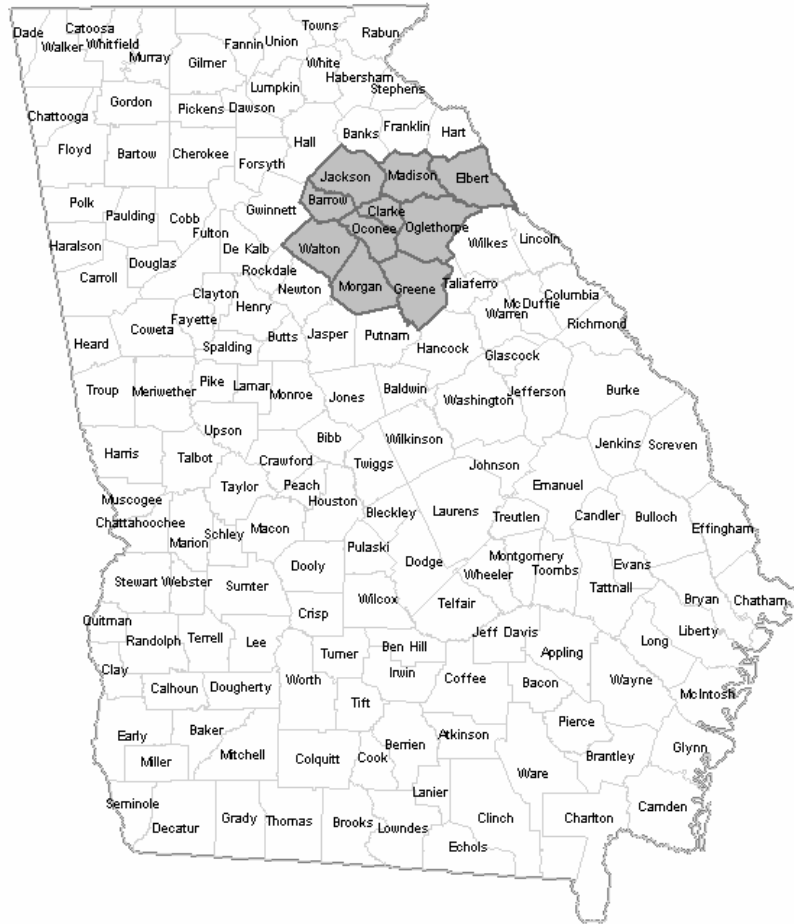
Figure 1-1: Planning Area

The location of these counties is shown in Figure 1-1.