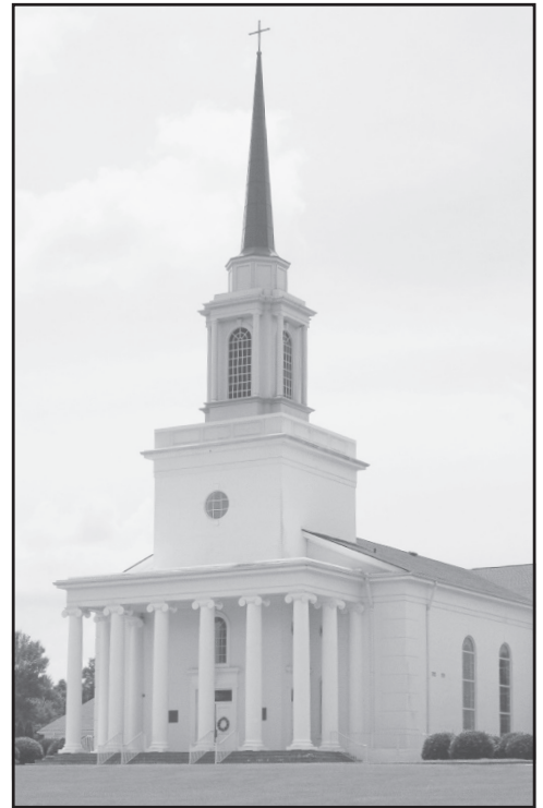
Bethlehem Methodist Church