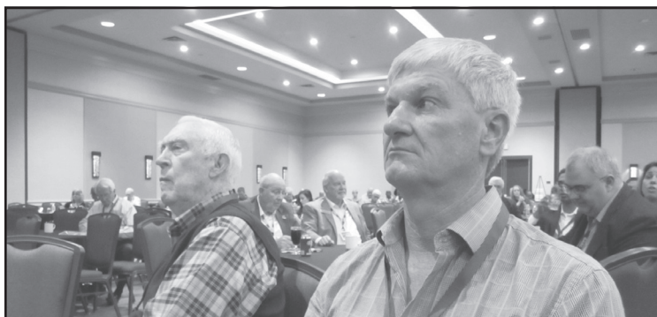
Houston and Little