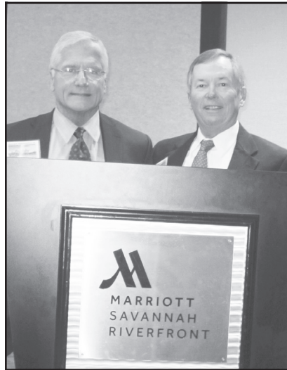
Duke and Dove