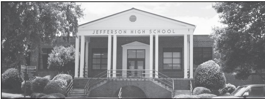
Jefferson High School