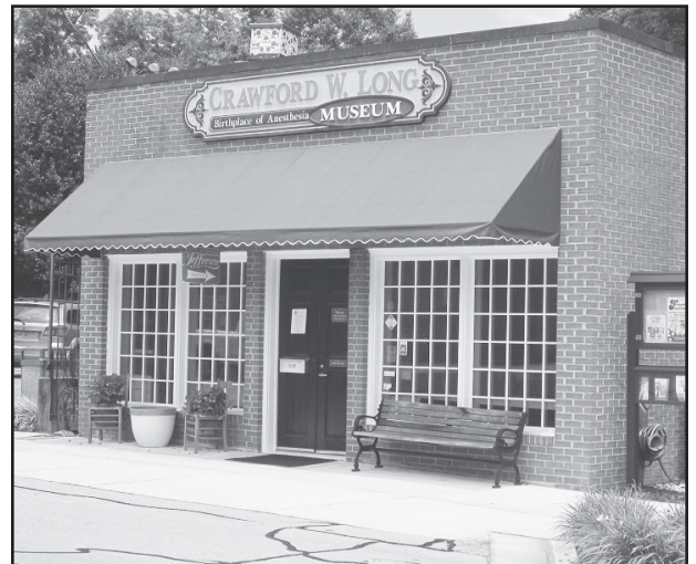
Crawford Long Museum