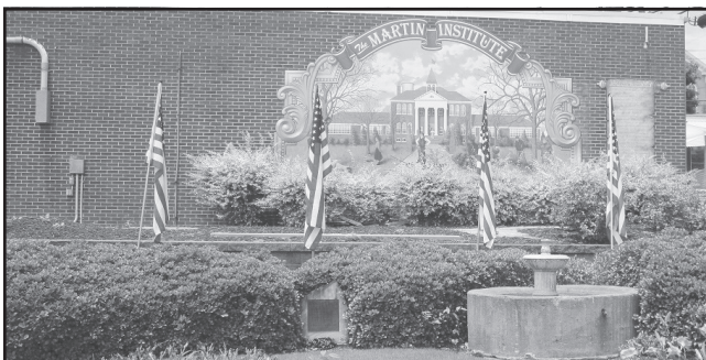
Martin Institute Mural