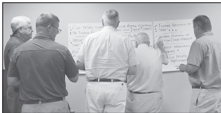
BOC Prioritizing Goals