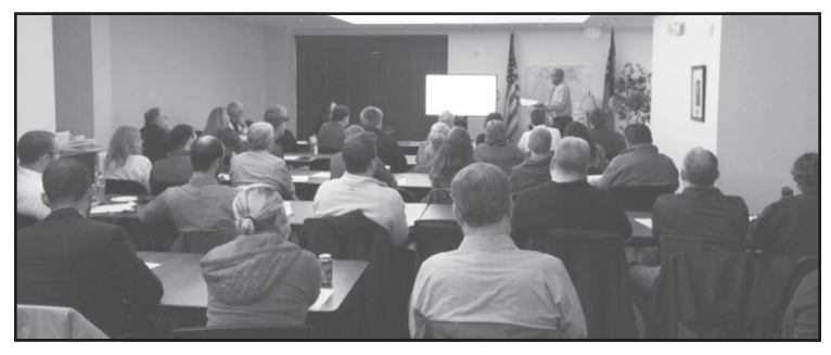
LUCA Training Attendees

For questions or to request NEGRC's assistance with LUCA, please contact Eva Kennedy, NEGRC Planner, at ekennedy@negrc.org or (706) 369-5650.