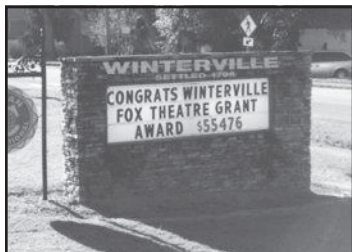
Grant Award Recipient

through a variety of activities including emergency funding, preservation plans and studies, and restoration (construction) grants. Information about the FTI program can be found on their website at: https://foxtheatre.org/the-fox-theatre-institute/fti-pres-grant-program/ .