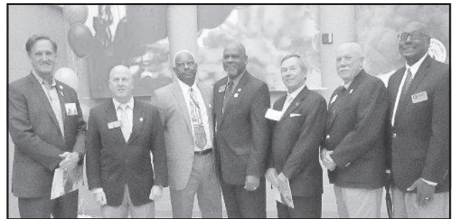
Dignitaries at Ribbon Cutting