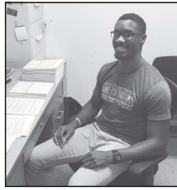
Summer Work Experience Participants