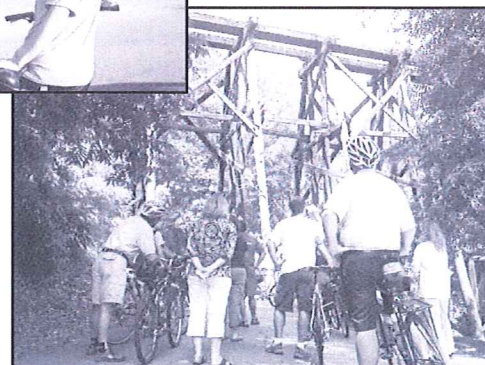
Bikers on Oconee River Greenway ►