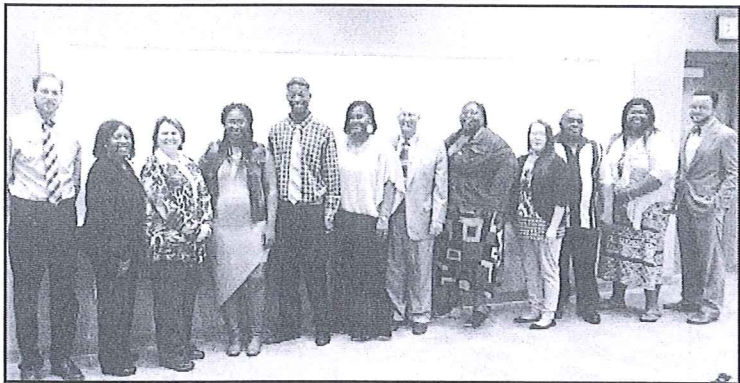
Elbert County Graduates