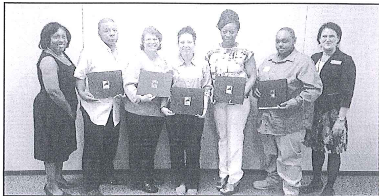
Athens-Clarke Manufacturing 101 Course Graduates

Funding for these programs was provided through the Northeast Georgia Workforce Development Board and the Northeast Georgia Regional Commission's Workforce Division utilizing federal Workforce Innovation and Opportunity (WIOA) funds. For information on future classes being offered in the region, please contact the NEGRC Workforce Division at (706) 369-5703 or Athens Technical College's Economic Development Division at (706) 369-5876 .