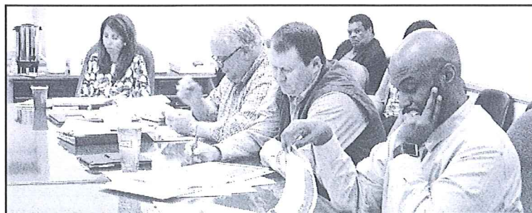
Newton County Retreat Participants