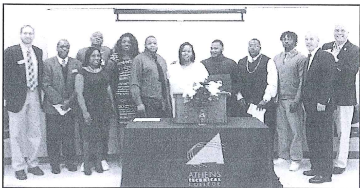
Greene County Graduates