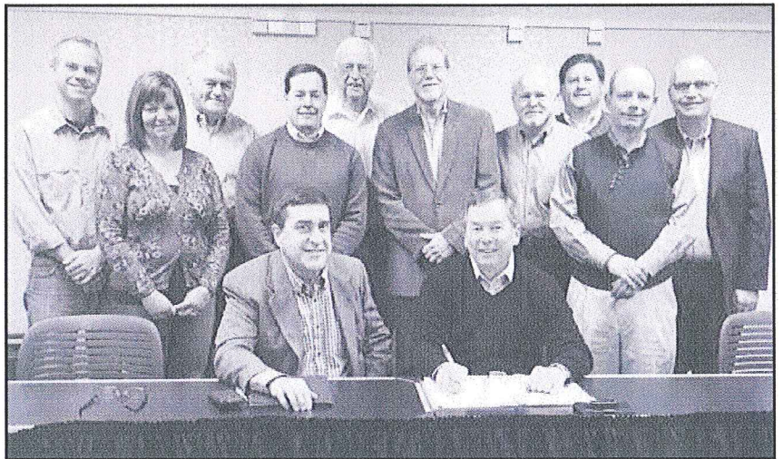
DDAA Board Members