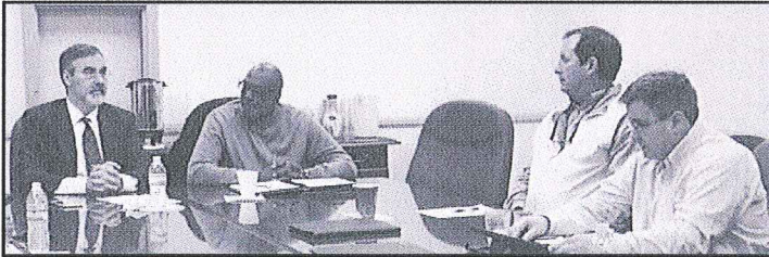
City of Madison