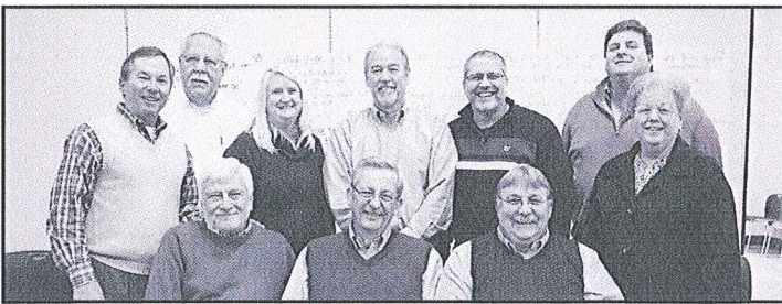
City of Jefferson