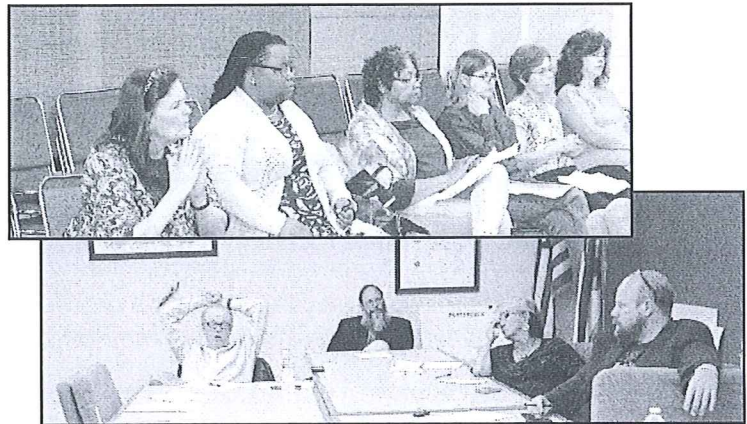
Village of Porterdale