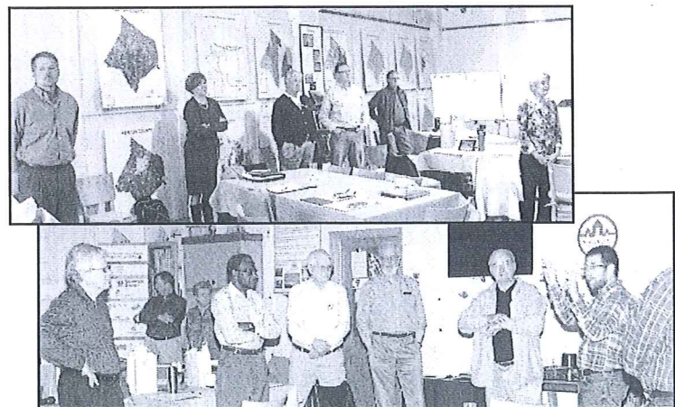
City of Oxford