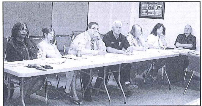
Village of Porterdale