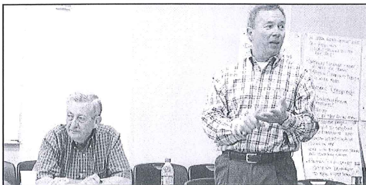
City of Jefferson