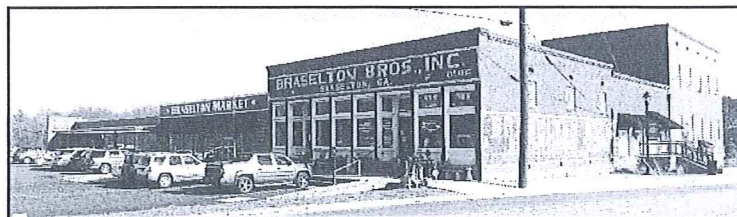
Below: Braselton Brothers Store