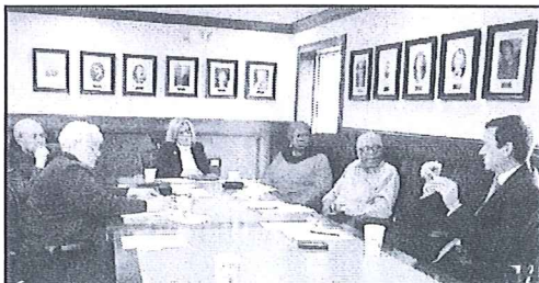
Winder Housing Authority

The City of Jefferson Mayor and Council held its annual Planning Retreat on March 26 th at the new Jefferson Station meeting room. Key points of discussion included downtown development, economic development, Parks Creek Reservoir, public works, internet/data connectivity, fire services, civic center, and governance and administration.