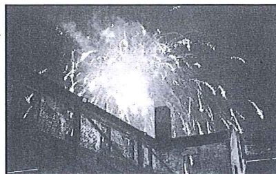
Left: Porterdales gym