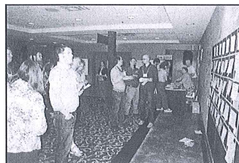
(Right) Georgia Trail Summit attendees at "The Wall," deciding which of 28 "unconference" sessions to attend.

Walton Wellness, a health promotion nonprofit in Walton County, approached the NEGRC for mapping and graphical assistance in support of its Project Road Share (PRS) activities. PRS promotes communities that wish to welcome homegrown and out-of-town bicyclists to local roads in support of healthy recreation, safe cycling, and economic development through tourism. The NEGRC proudly produced maps and other information for use at two existing trailheads, with additional communities expected to build facilities soon.