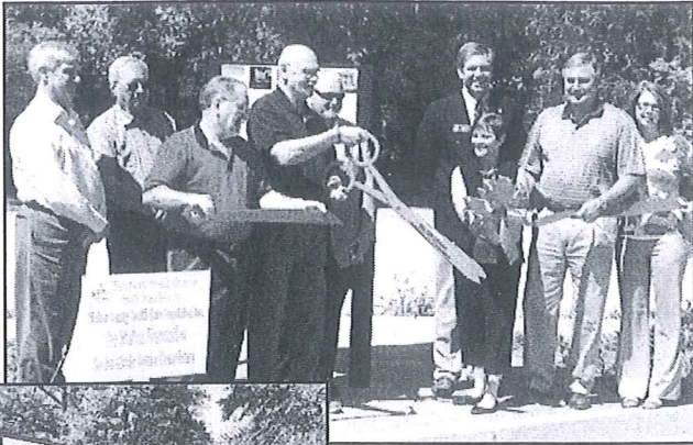
(Above) Project Road Share ribbon-cutting ceremony in Social Circle.