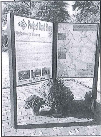
(Left) Project Road Share kiosk at Social Circle Trailhead.