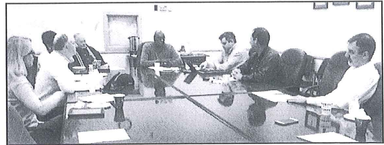
City of Madison