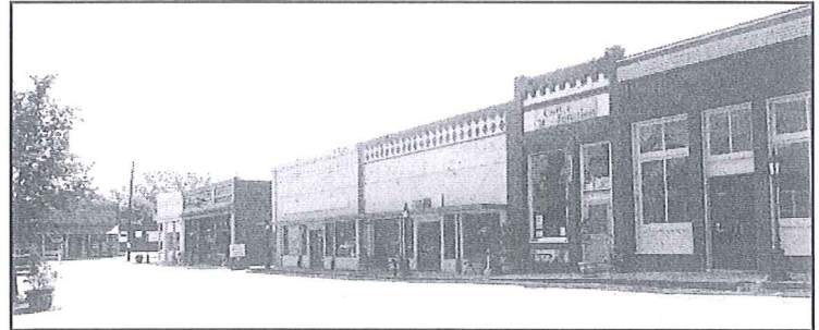
Historic Downtown Bowman