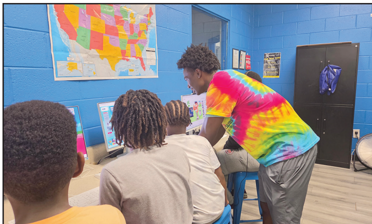
Walton County Student