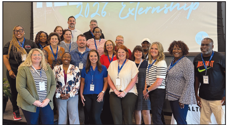
Clarke County Teachers