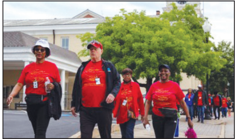
Newton County Senior Services Participants enjoying the Chairman/Mayor's Walk and activities