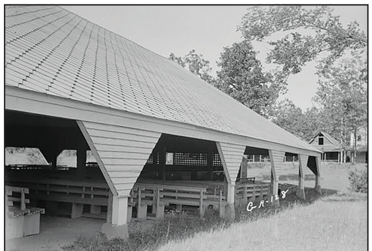
Salem Campground was documented as part of the Historic American Building Survey in 1936.