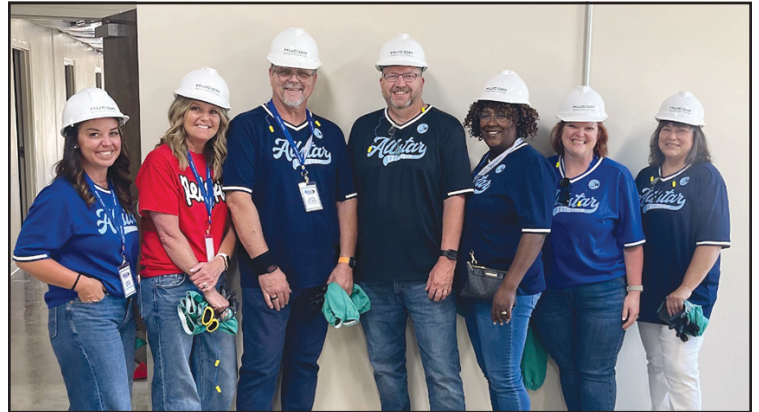
Walton County Teachers

This summer, educators from Clarke and Walton Counties participated in the Teacher Externship Program, a five-day professional learning experience that places teachers in local businesses and industries to gain firsthand knowledge of workplace practices, skills, and high-demand career opportunities. By immersing themselves in these career fields, educators strengthened partnerships with community employers and discovered meaningful ways to connect classroom instruction to real-world applications. At the conclusion of the program, participants shared what they learned through classroom-ready projects and lesson resources designed to help students explore career pathways, develop workforce skills, and see the relevance of their learning beyond the classroom.