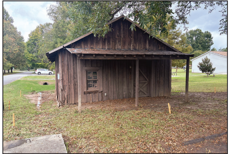
Winterville Blacksmith Shop, 100 Marigold Lane, Winterville, before...