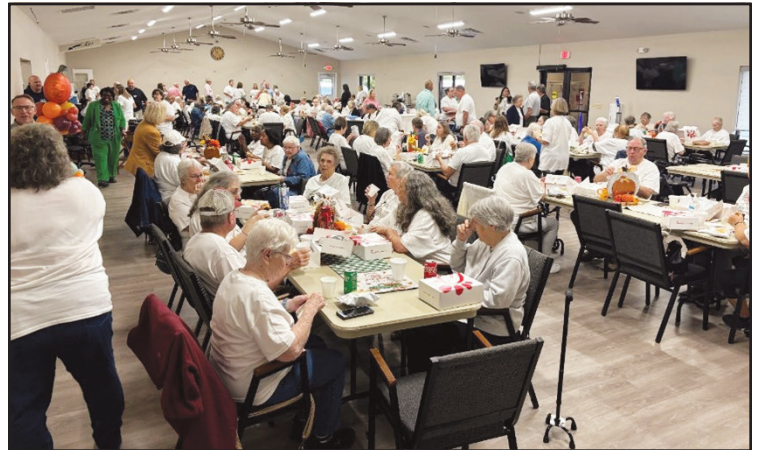
Happy Seniors and attendees in the Fellowship Hall

The Jackson County Senior Center serves over 260 clients. The site continues to grow. If you or someone you know in Jackson County who is in need of meal supports, please contact or visit the Jackson County Senior Center or call Northeast Georgia Area Agency on Aging at 1-888-808-8020 to learn more about meal programs and services availability.