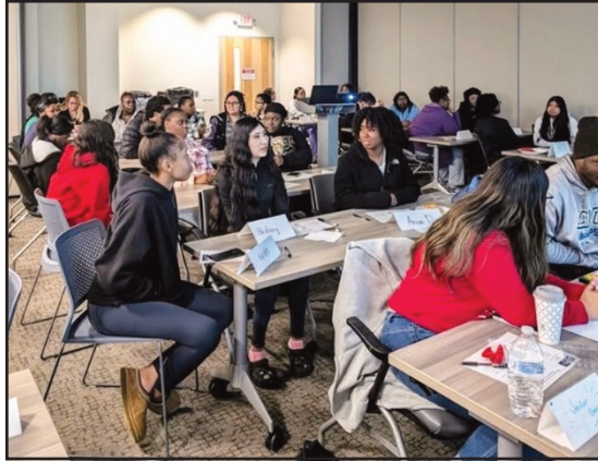
Group Picture of Workshop Participants