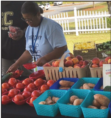
Red Clay Produce Selection