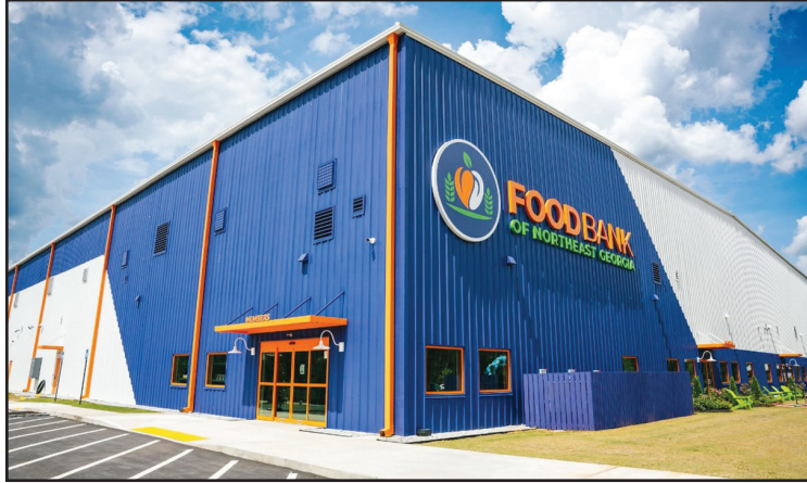
The entrance of the new facility for the Food Bank of Northeast Georgia, located at 890 Newton Bridge Rd, Athens, GA 30607

service area, it is estimated that over 68,000 residents are considered food insecure, a term used by the United States Department of Agriculture to define residents who experience limitations to food access. Annually, the FBNEG distributes over 11 million pounds of food to residents within its service area and partners with dozens of organizations to assist with the logistics of food delivery. They truly are an essential non-profit to our region's resiliency and will now be even more prepared to respond to future emergencies and functionally eliminate food insecurity in the region.