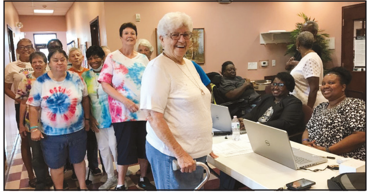
AAA Staff took a break to pose for the picture with the Happy Seniors of Walton County Senior Center