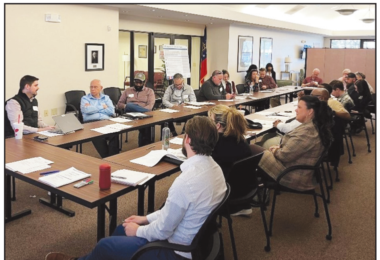
Stakeholder engagement session hosted earlier in 2024 at the NEGRC main office

The Georgia Department of Transportation, in partnership with Blue Cypress Consulting, has nearly completed its process of assisting the Northeast Georgia Regional Commission (NEGRC) with creating a regional, transit-development plan (TDP) that explores alternatives for public transit service throughout the 12-county area. This is part of a statewide initiative to develop transit service throughout Georgia's 159 counties to eliminate barriers to economic opportunity for residents. The plan provides robust documentation of regional mobility conditions and contributing context and identifies next steps to advance specific transit service recommendations. Where relevant, the plan identifies alternative service options that advance long-term transit goals but require further regional consideration. The overarching goal of the Regional TDP is to facilitate public transit accessibility to all community members in the region with particular focus on residents who are transit dependent. This document will serve as an informational resource and decision-making tool for local governments in the years to come. Once adopted, the document will be available on the NEGRC website.