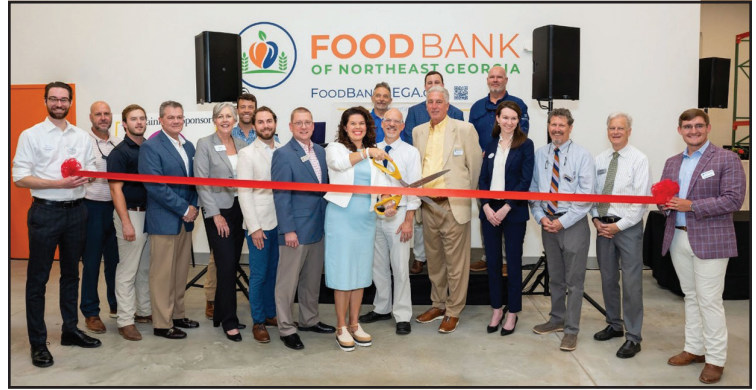
A ribbon cutting ceremony for the Food Bank of Northeast Georgia's new facility on July 18, 2024 with project partners.

more than doubles the Food Bank's capacity to serve the region and increases their footprint from 37,000 sq. ft. to 63,000 sq. ft. The project was a culmination of three years of work between multiple project partners and will significantly improve the region's food security.