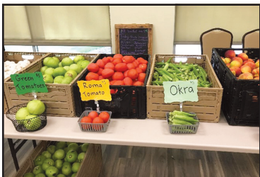
Hyman Agriculture and Consulting Produce