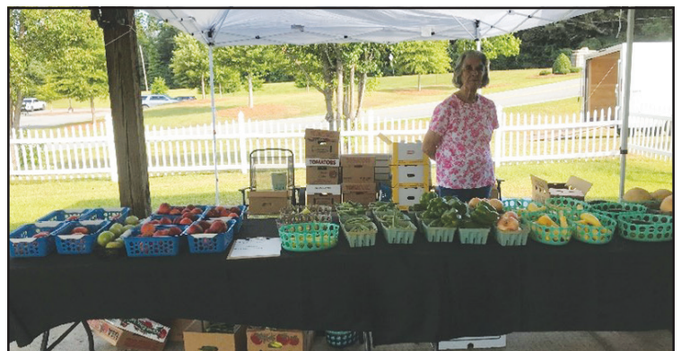
The Garden Market Produce

For anyone knowing any seniors that need nutritional support, please contact your local senior center for information and support or call the Aging and Disability Resource Connection at 1-888-808-8020 .