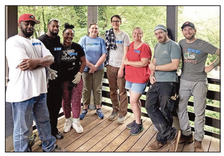
NEGRC staff from the Planning & Government Services division and the Workforce division enjoy a break on the front porch during a Habitat for Humanity Build Day.

A shortage of affordable housing has become a national issue, and the staff at the NEGRC in all departments try to make a difference in bridging the gap through grant applications, social services, and workforce training. Our staff participating in the volunteer day benefitted from learning more about the construction process and how local nonprofits can serve their communities in the housing sector.