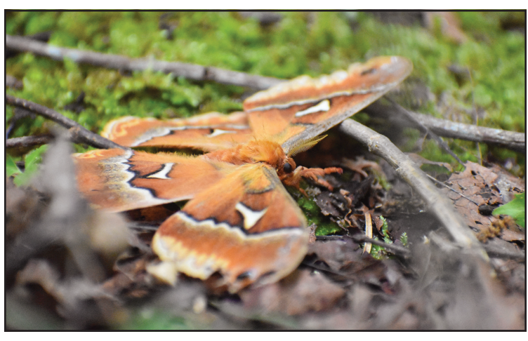
Cecropia moth (Hyalophora cecropia) seen on the banks of the Broad River on May 18, 2024.