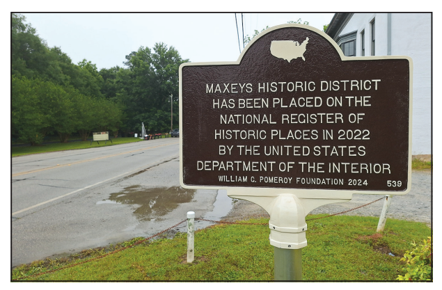
Historical marker installed on State Route 77 in the City of Maxeys on May 18, 2024.

Services Division at (706) 369-5650 or pgsassist@negrc. org.