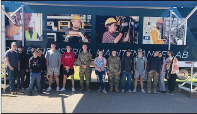
Madison County High School students