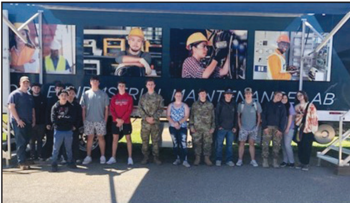
Morgan County High School students

'And that's a wrap' for this year's Career Fairs! For information on the training trailers or other Workforce Development resources, please contact the NEGRC Workforce Development Division/ WorkSource Northeast Georgia at (706) 369-5703.