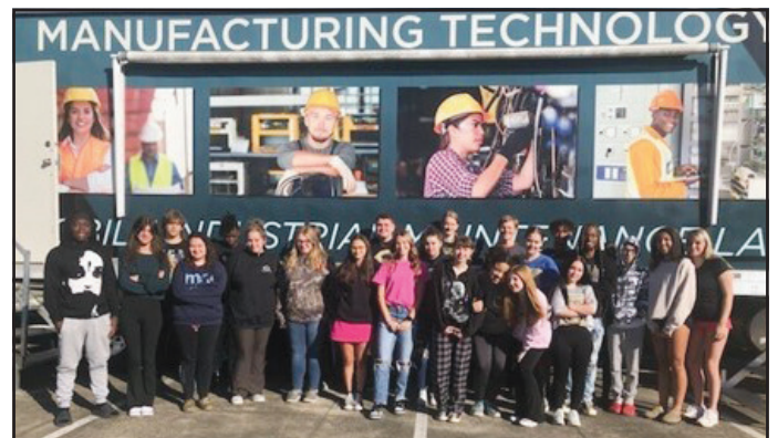
Commerce High School students