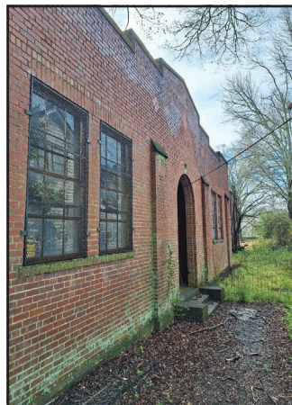
Conyers Street Gym side entrance as seen on a site visit on March 6, 2024

The CDBG-RDF program is a set-aside of Georgia's non-entitlement, competitive CDBG Program. The RDF provides local governments access to flexible financial assistance to help them implement projects that cannot be undertaken with the usual public sector grant and loan programs. The program is focused on the "elimination of slum or blight", per CDBG national objectives, and can be a unique tool for the rehabilitation of historic buildings. If awarded, the transformation of this building from its current state will add much value to the surrounding neighborhoods of Covington.