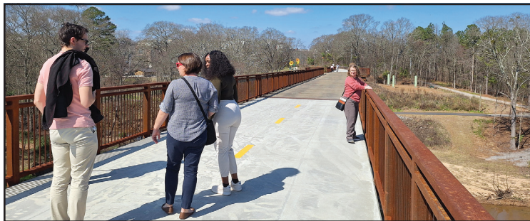
PGS walking over the Peter Street bridge along the Firefly Trail. The bridge was completed in 2023 through the Athens-Clarke County TSPLOST program and links the eastside of Athens to downtown with an at-grade multi-use trail.

Projects such as these are multifaceted and complex. They require patience and knowledge of multiple professions to successfully implement the community's goals. If you have a trail idea for your community, contact the PGS Department to schedule a consultation.