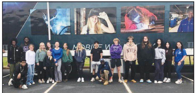
Monroe Area High School students attend Career Fair on NEGRC Mobile Welding Trailer