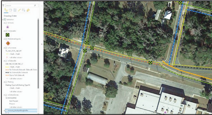
An example of the REVAMP transportation data collection and validation process using ESRI ArcPro.

Data elements from Phases 1 and 2 are currently available to all local governments in Northeast Georgia, and Phase 3 elements will soon be available. If you want to learn more about the REVAMP program or want access to this GIS data, contact Phillip Jones at the NEGRC at pjones@negrc.org .