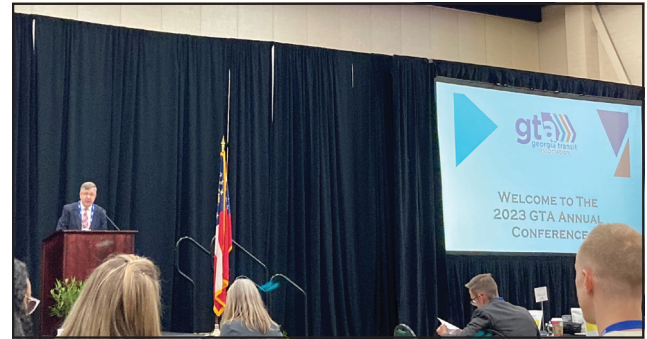
Georgia Transit Association Conference kick-off