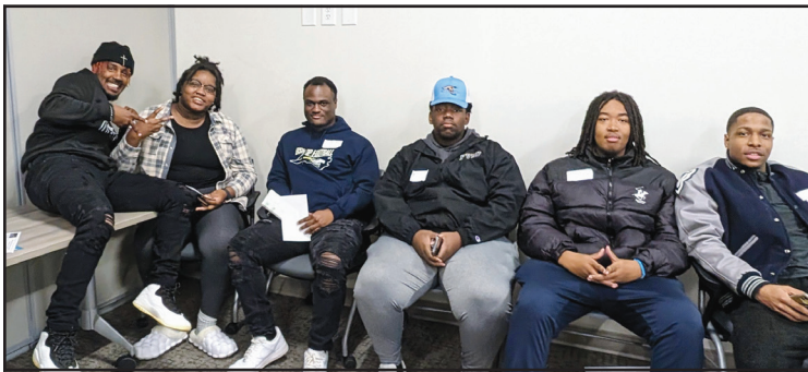
Graduates share information to prepare for college