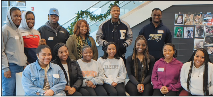
Elbert County students that attended