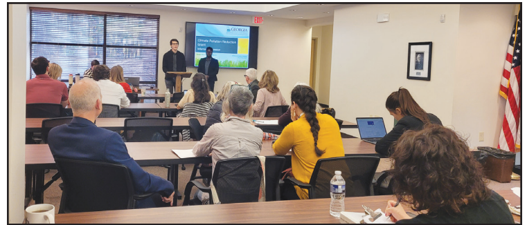
Climate Pollution Reduction Grants program stakeholder meeting at the NEGRC

As part of the Inflation Reduction Act, the Climate Pollution Reduction Grants (CPRG) program provided $5 billion in grants to states, local governments, tribes, and territories to develop and implement plans to reduce greenhouse gas (GHG) emissions and other harmful air pollution. This two-staged grant program provides funding of $250 million for noncompetitive planning grants ($3M to each lead agency to develop a Climate Pollution Reduction Plan) and $4.6 billion for competitive implementation grants.