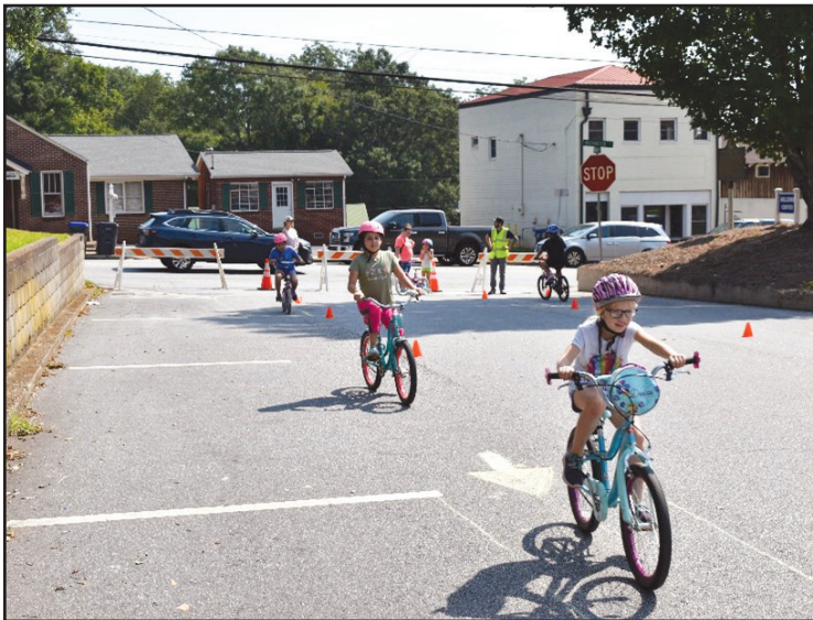
Girl Scouts learning how to safely ride along the side of North Avenue with and without the presence of a bicycle lane.