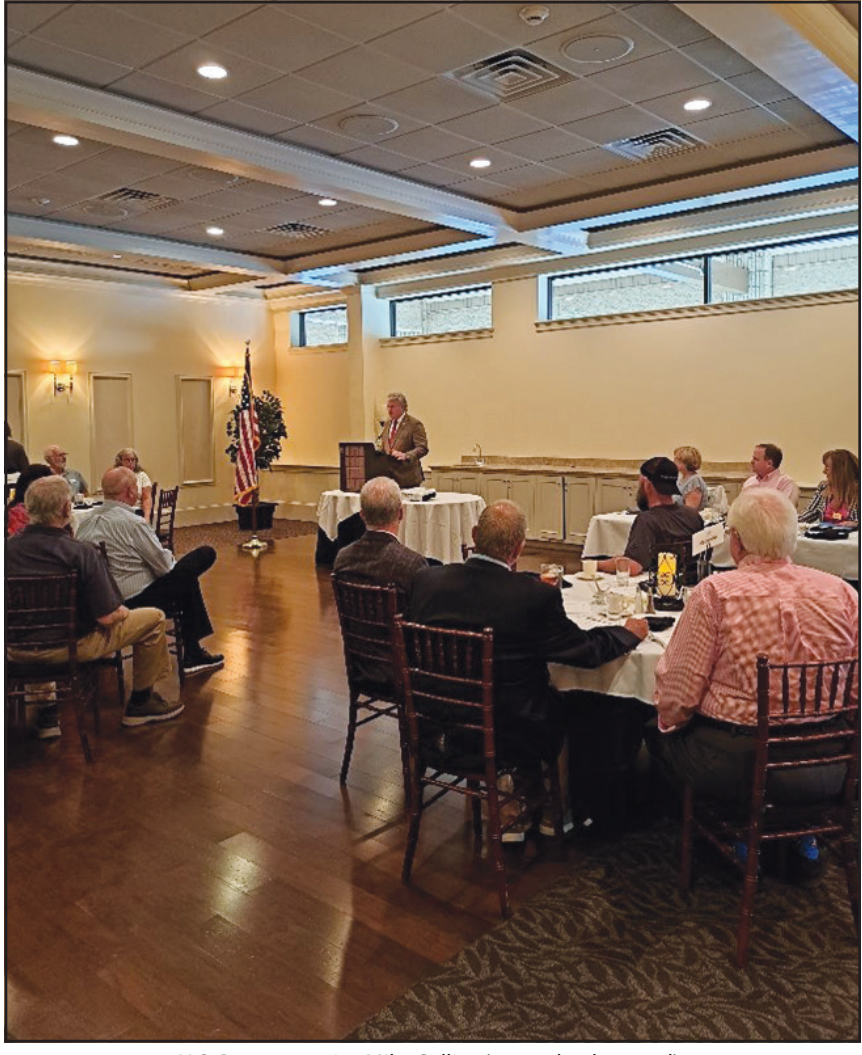
U.S. Representative Mike Collins (center-background) addressing the NEGRC Council.