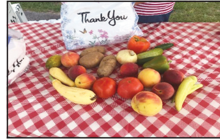
Samples of Fresh Fruits and Vegetables

The Seniors Farmers' Market Nutrition Program (SFMNP) is designed to provide low-income seniors access to locally grown fruits, vegetables, honey, and herbs. The domestic consumption of agricultural commodities is increased through farmers' markets, roadside stands, and community-supported agriculture programs.