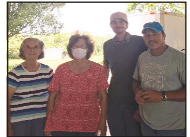
Dupree Farms will provide fresh fruits and vegetables to 1900+ seniors in Northeast Georgia