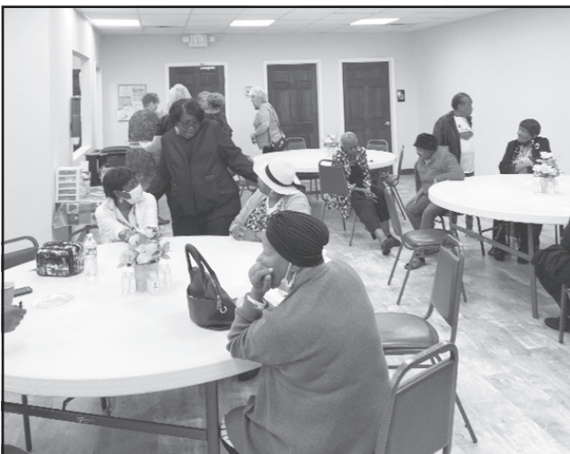
Seniors using newly renovated space at the new location for the Walton County Senior Citizen Council - Social Circle Division