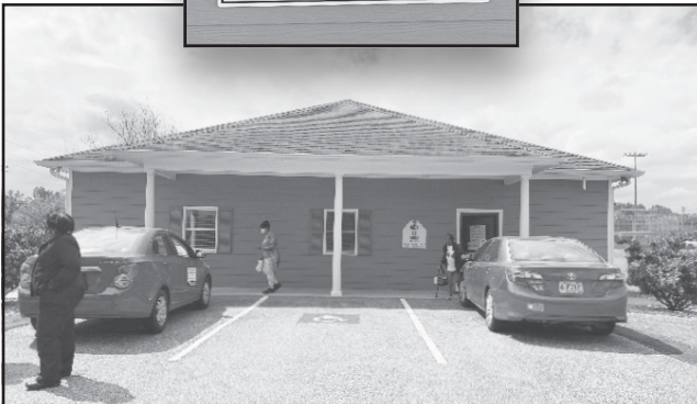
Walton County Senior Citizen Council - Social Circle Division