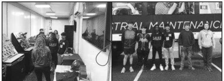
Morgan County High School Career Day

For further information on this or other workforce development programming available through the WorkSource Northeast Georgia/NEGRC Workforce Development Division, please call (706) 369-5703 .