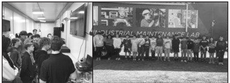
Jackson County, Jefferson Middle School Career Day