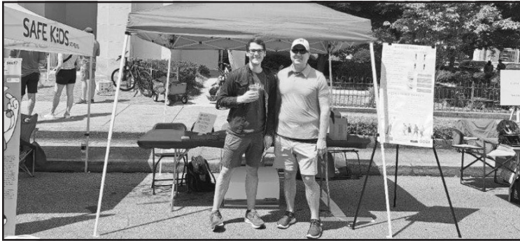
Staff from the Planning & Government Services Division and Area Agency on Aging tabled at the 2023 Athens Twilight Criterium with Georgia Safe Routes to School on April 22, 2023.