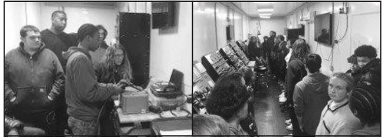
Newton County, Eastside High School Career Day

Counties. Over 1,300 students at Monroe Area High School, Eastside High School, Jefferson Middle School, and Morgan County High School had an opportunity to hear about careers in the advanced manufacturing sector and practice with a welding simulator.