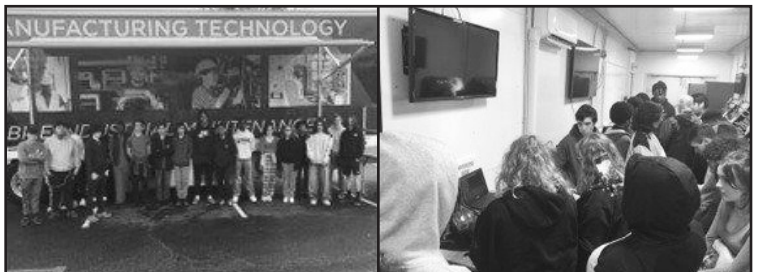
Walton County, Monroe Area High School Career Day