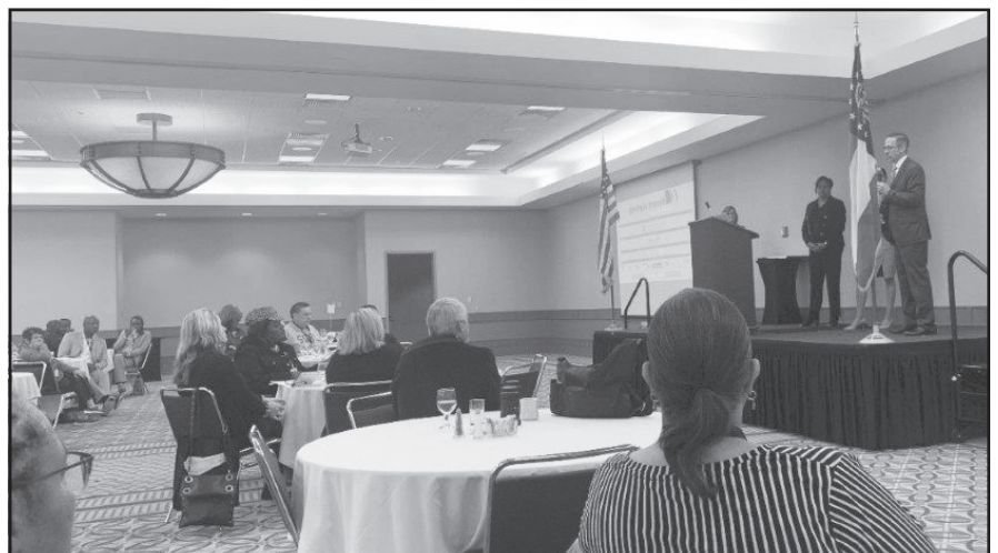
Industry update panel discussion from FTA, GDOT, APTA, and CTAA