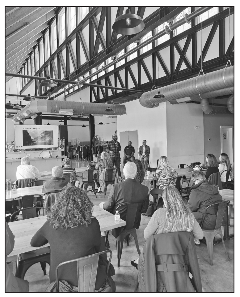
Mobile workshop focusing on small business production and outdoor recreation