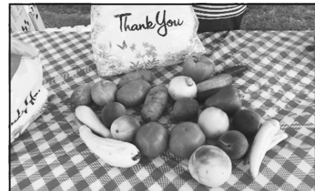
Sample of fresh fruits and vegetables. Cantaloupes and Watermelons were also available.

If you or if you know any seniors that need nutrition support, please contact the local senior center for resources or the Aging and Disability Resource Connection at 1-888-808-8020.