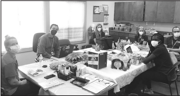
Department of Public Health Staff at Oglethorpe Senior Center to administer COVID-19 vaccine and boosters.

Ongoing efforts like these will slow the spread of the virus and its variants. The AAA and its Services Providers will continue to do their part in the fight to end COVID-19 and will continue to encourage the senior citizens and the community to do the same. If you or if you know of anyone wanting to learn more about COVID-19, vaccination, or booster please reach out to the local public health, local senior center, or AAA for information. AAA staff can be reached at 1-888-808-8020.