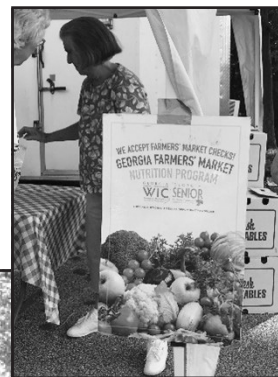
The Garden Market Farmers

Following the hearing, there will be several opportunities to participate and provide input for the plan, including an online survey which will be shared with all local governments in the region and will