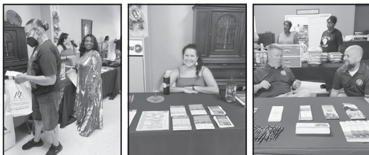
ACCA and the Veterans Administration Participates in NEGA Senior Expo