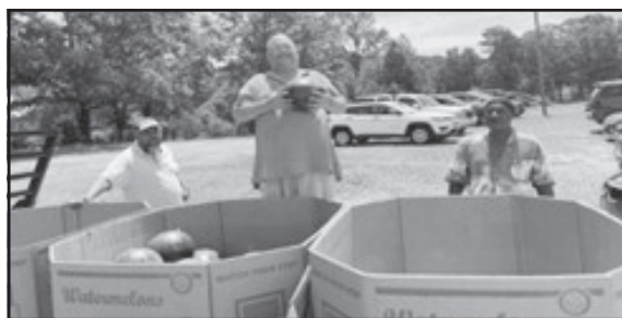
Volunteers Assist with Distributing Produce