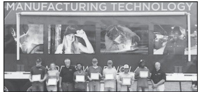
Class graduates pictured with representatives from Workforce Innovators, Inc.

This cohort of the program was a partnership between United Way of Northeast Georgia, Workforce Innovators, Inc. and the Northeast Georgia Regional Commission (WorkSource Northeast Georgia). The goal is to prepare recent high school graduates for jobs through intense short-term skills training. A training curriculum is developed after consulting with employers and staffing agencies to understand the local workforce needs and then prepares students through the short-term skills training to meet those needs. Training was delivered on the WorkSource Northeast Georgia/NEGRC 8 bay welding training trailer. This group represents the first WeldReady Cohort at the Morgan County campus.