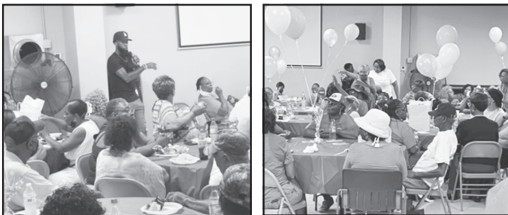
Senior enjoying treats, fruits, vegetables, and information on services in Northeast Georgia.