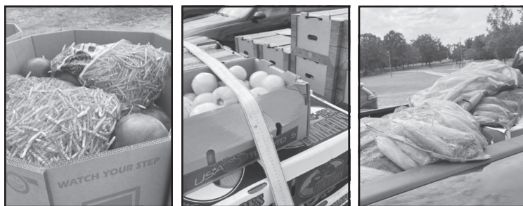
Fruits and Vegetables from Harvest Time Produce of Comer, GA