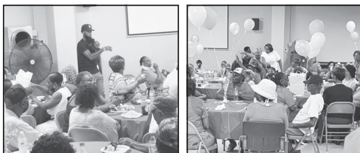
Senior enjoying treats, fruits, vegetables, and information on services in Northeast Georgia.