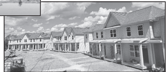
(below) A new townhome development under construction located on Research Drive in Athens-Clarke County.