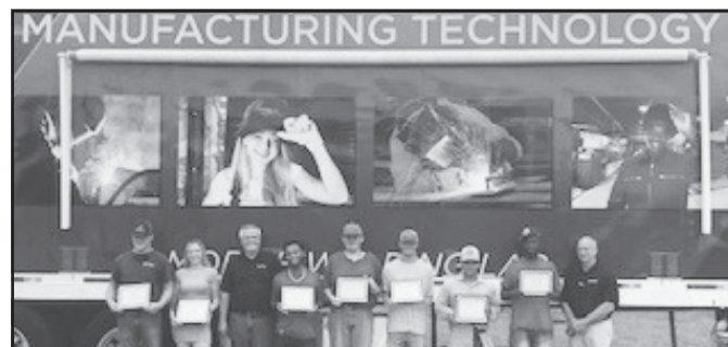
Class graduates pictured with representatives from Workforce Innovators, Inc.

This cohort of the program was a partnership between United Way of Northeast Georgia, Workforce Innovators, Inc. and the Northeast Georgia Regional Commission (WorkSource Northeast Georgia). The goal is to prepare recent high school graduates for jobs through intense short-term skills training. A training curriculum is developed after consulting with employers and staffing agencies to understand the local workforce needs and then prepares students through the short-term skills training to meet those needs. Training was delivered on the WorkSource Northeast Georgia/NEGRC 8 bay welding training trailer. This group represents the first WeldReady Cohort at the Morgan County campus.