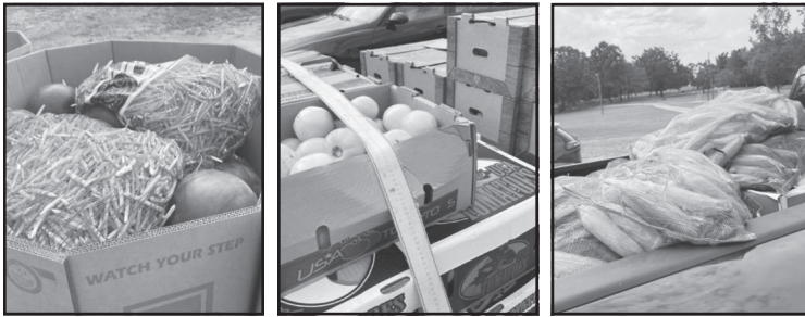
Fruits and Vegetables from Harvest Time Produce of Comer, GA