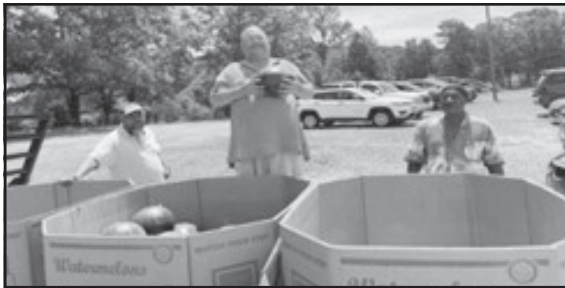
Volunteers Assist with Distributing Produce