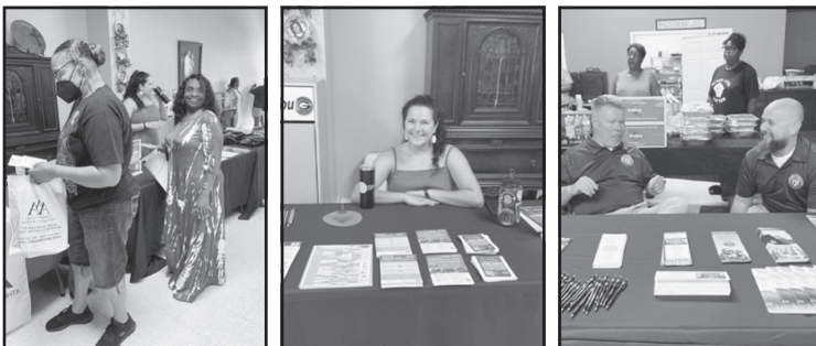
ACCA and the Veterans Administration Participates in NEGA Senior Expo