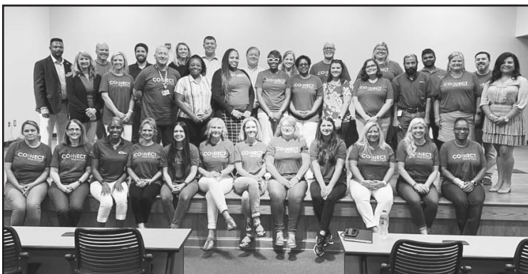
Walton County Educator Externs