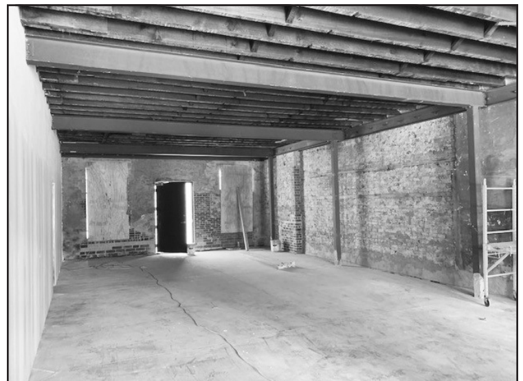
One of two stabilized interior commercial spaces, facing the rear of the building. Each space is approximately 1,500 square feet and will provide a customizable retail opportunity.