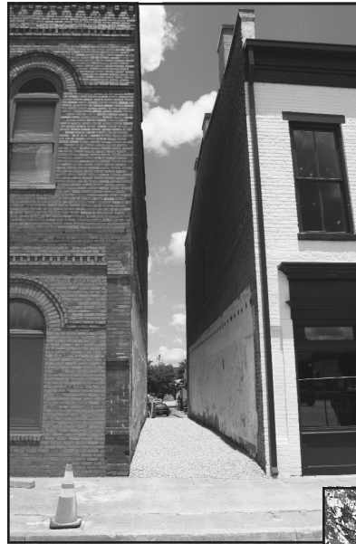
Newly accessible alley providing access to public parking behind the building. This alley was previously inaccessible due to an accessory building that was vacant and unoriginal to the site.