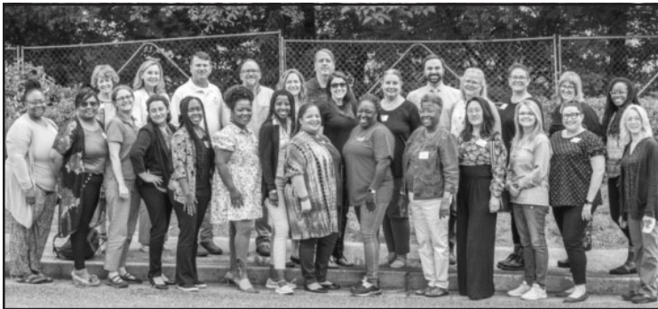
Clarke and Madison County Educator Externs with some of the participating businesses as well as some of the sponsors

For further information on the Educator Externship Program or other WorkSource NEGA (NEGR) programs/initiatives, please contact NEGR, Workforce Development at (706) 369-5703. Pictures below are from some of the externship sites.