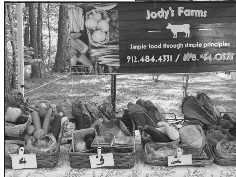
Jody's Farms participates in Newton County's 50th Seniors Anniversary Celebration by delivering fresh fruits and vegetables to the participants.