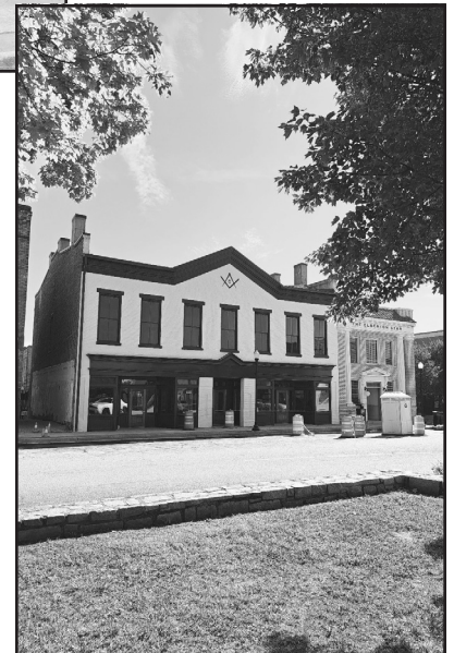
Rehabilitated façade of the historic Bailey Building as seen from the Elberton Square. Central access to the second floor was re-established, accompanied by two new storefront entrances. The original Masonic Square and Compasses emblem was kept as an ode to the building's past.