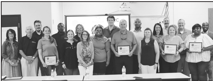
Greene County Educator Externs with some of the participating businesses