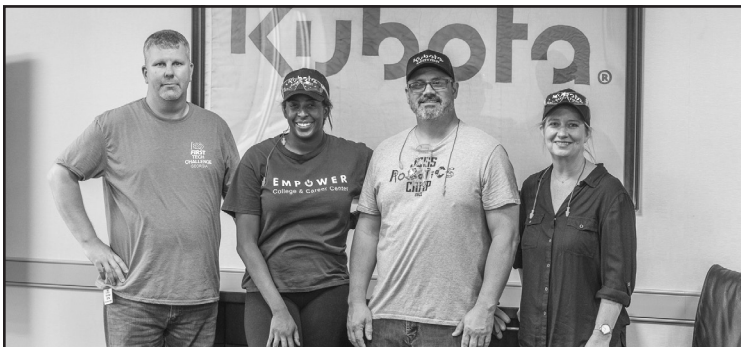
Jackson County Educator Externs