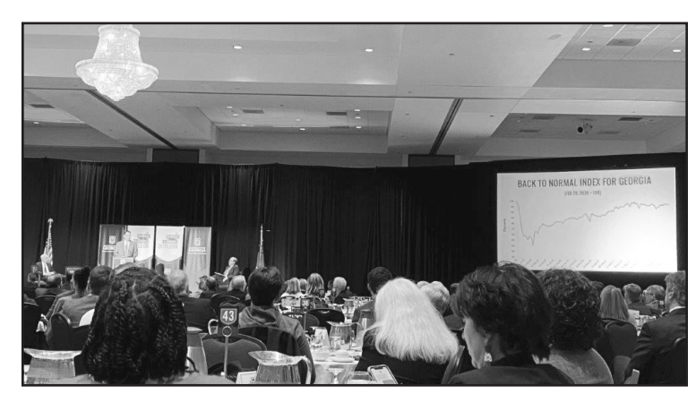
Georgia Economic Outlook 2022 held at the Classic Center in Athens

In February, the University of Georgia's Terry College of Business presented key economic trends and risk forecasts at the Georgia Economic Outlook 2022 at the Classic Center in Athens. This annual series provides expert predictions from the Selig Center for Economic Growth for national, state, and metro-area economies.