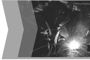
Foothills Welding Program