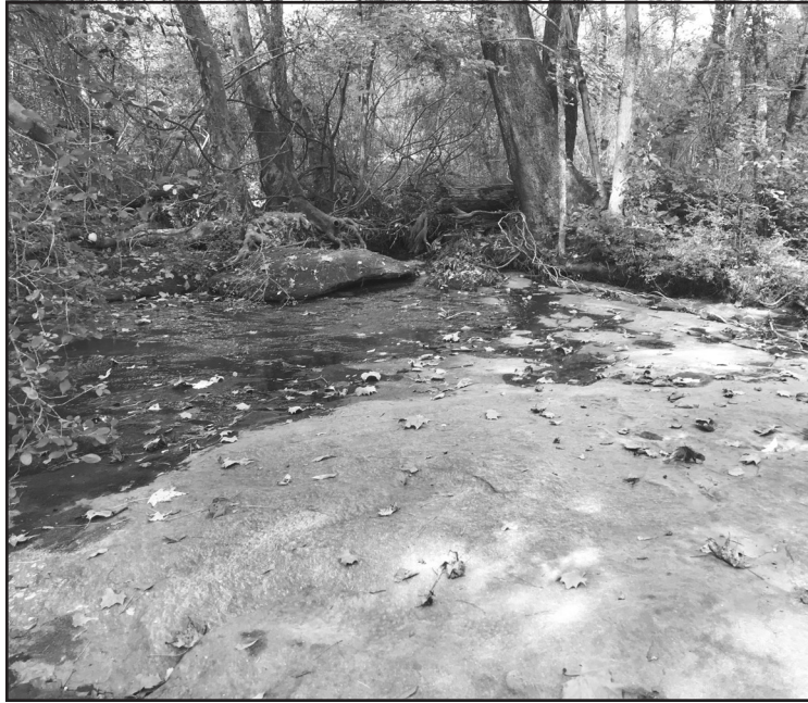
The planned trail parallels and then crosses this small, picturesque stream.