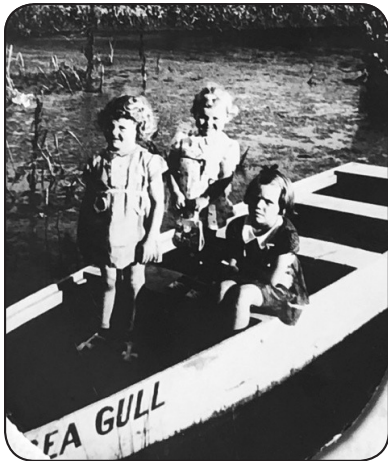
In the past, children enjoyed boat rides in the former park operated by the Bellgrade Manufacturing Company as shown in this historic photograph.