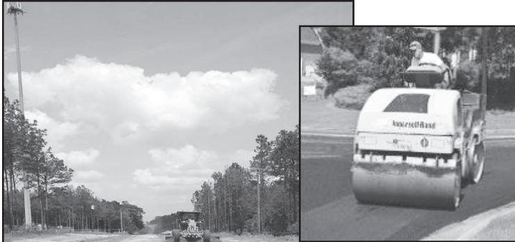
GTIB provides funding for a variety of road, bridge, and transportation related projects

For any further information or to access the grant application, please visit SRTA's website at www.srta.ga.gov/gtib or contact GTIBinfo@srta.ga.gov .