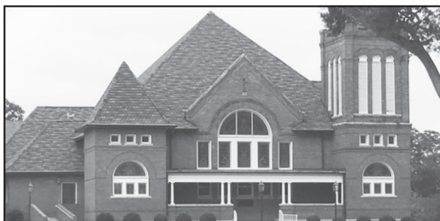
First Baptist Church