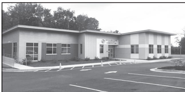
Boys & Girls Club