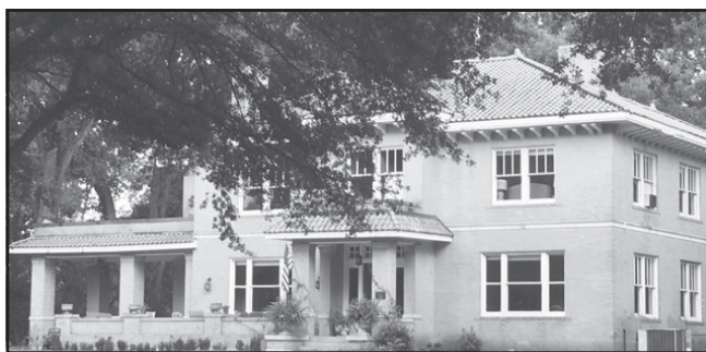
Governor Hardman House