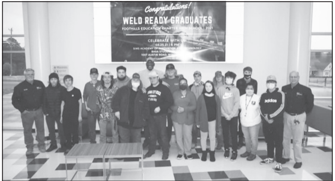
Graduates from the WeldReady Program