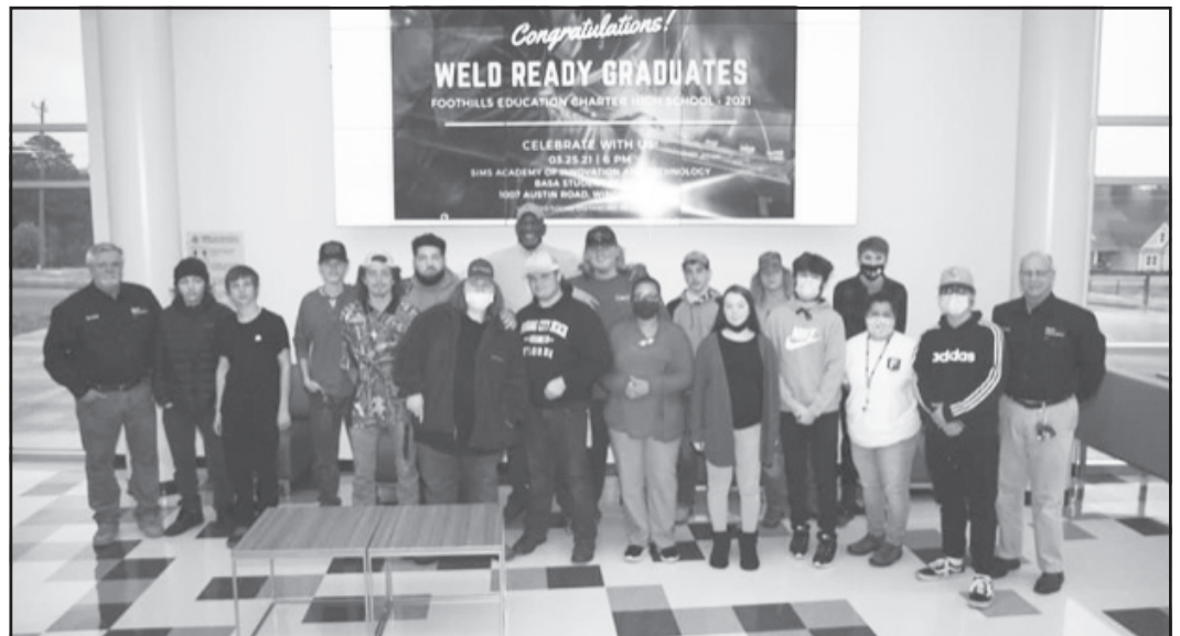
Graduates from the WeldReady Program