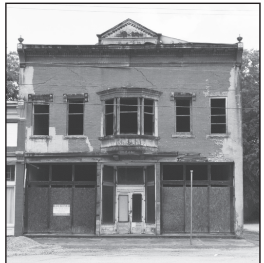
A previous “Places in Peril” property in Maxeys, Georgia