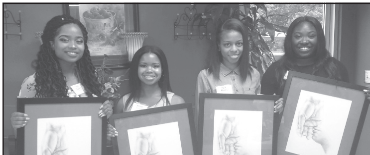
B.J. Smith Community Servant Award Recipients