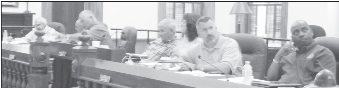
Walton County Retreat (above) and Jackson County Session (below)