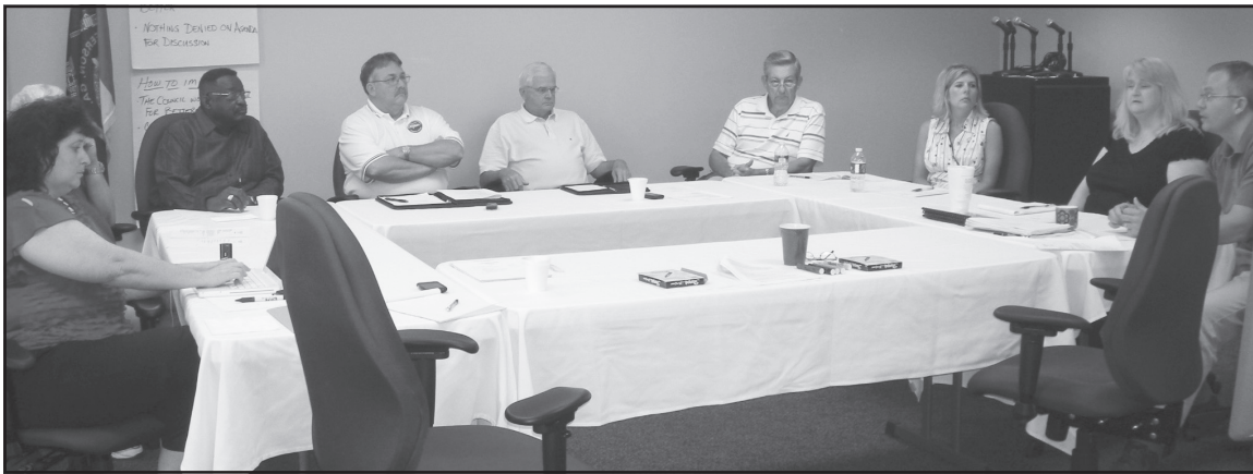
Jefferson Mayor and Council