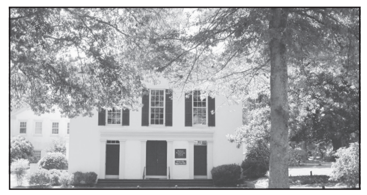
Historic Presbyterian Church