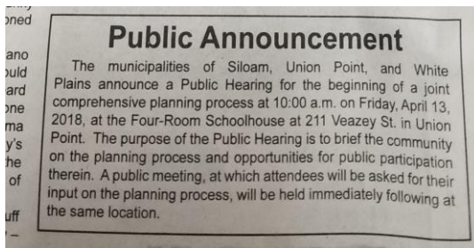
Published 3/29/18 in the Herald Journal