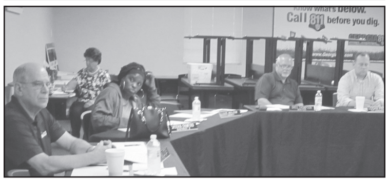
Monroe Retreat Participants