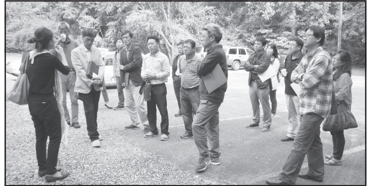
Korean visitors above