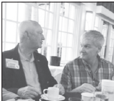
Lyon & Little