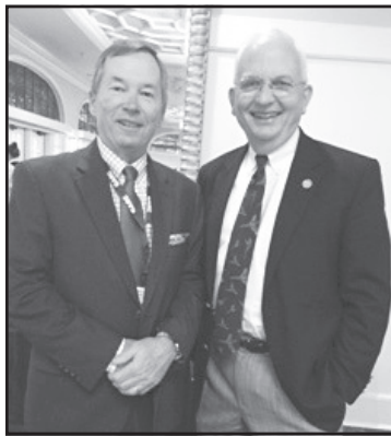
Dove & Black