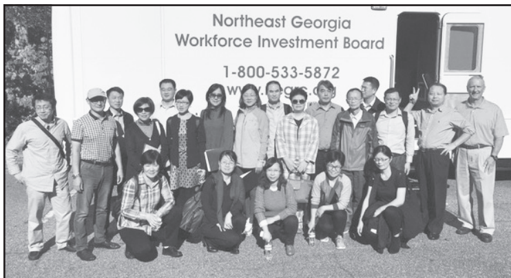
Chinese visitors above