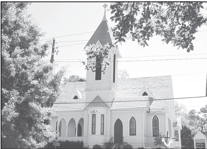
Ashford Memorial Methodist Church