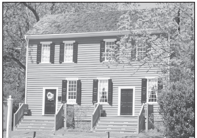
Eagle Tavern Museum