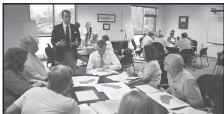
Public Hearing Group

uses that would primarily serve the residents close-by. After hearing public comments, the Planning Commission voted to recommend that the