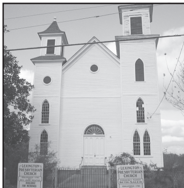
Historic Presbyterian Church