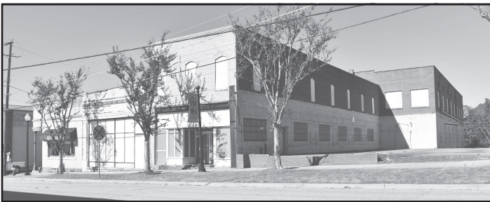
Historic Oxford Building in Commerce