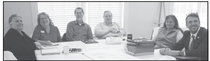
City of Winterville