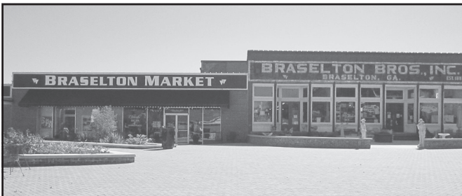
Former Braselton Brothers Store

In the early 1980's, the 3,500 acre Chateau Elan Resort and Winery was opened, and the Town has continued to expand as development moves north from Metro Atlanta. Panoz Auto Development, Mayfield Dairies, Haverty's Southeast Distribution Center, Mizuno, Whole Foods, Hitachi, Williams-Sonoma, PetCo, Year One, and Peachtree Tooling call Braselton home. Parks and rural space are important to Town residents also. In addition to the Braselton Town Park and a multi-use park along the Mulberry River, the Town is home to Thompson Mills Forest, Georgia's official State Arboretum. Many historic structures have been preserved. The Town Hall was built in 1909 and restored in the late 1990's. The Braselton-Stover House, built in 1918, is a popular site for weddings and receptions. A recent population estimate for the Town exceeds 10,200 persons.