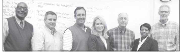
City of Madison