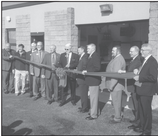
Jackson County Officials