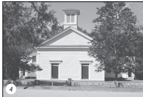
#1: Oxford City Hall #2 & #3: Campus Buildings #4: Old Church

The Northeast Georgia Regional Commission Council and Staff Wish You a Happy and Safe Thanksgiving!